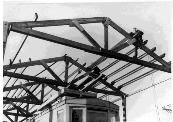
Fairview Car barn and Riverside Car barn at early stages of their respective constructions