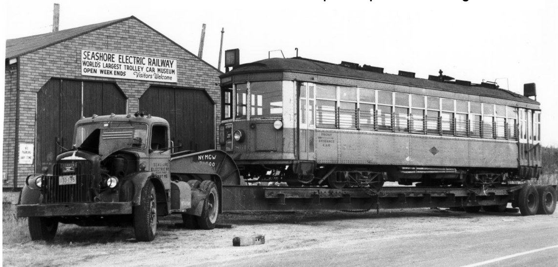
Milwaukee & Suburban Transport Corp Car 861 arriving at Museum

Montreal converted its richly varied streetcar system to bus in 1959 and our leaders arranged for the eventual shipment of 10 streetcars and interurban cars from that city.