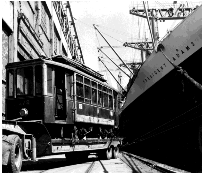
Car 279 – a gift from the Mayor of Rome, Italy – on its way to Seashore

Ted Santarelli's frequent worldwide travels resulted in the acquisition of four British double deckers, as well as cars from Australia, New Zealand, and several European cities - adding relevant international variety to the collection.